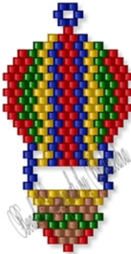
Figure 1 —Realistic Chart of Ballooning Design

Delica 11° Beads Needed for Ballooning Earrings (includes optional dangle)